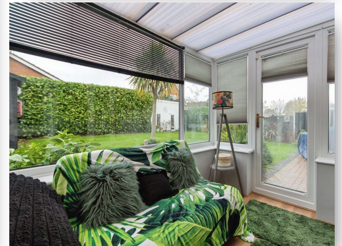
Ancaster Drive, Sleaford NG34 7LY