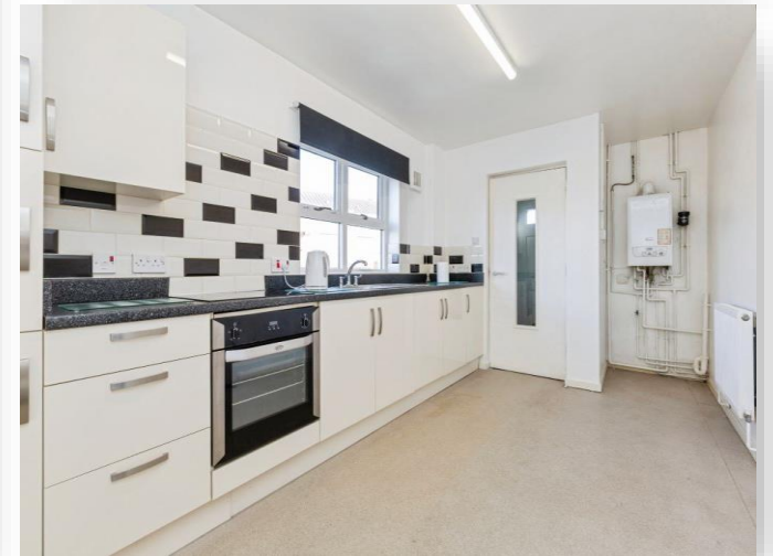
Millpool Close, Hartlepool, TS24 0TH