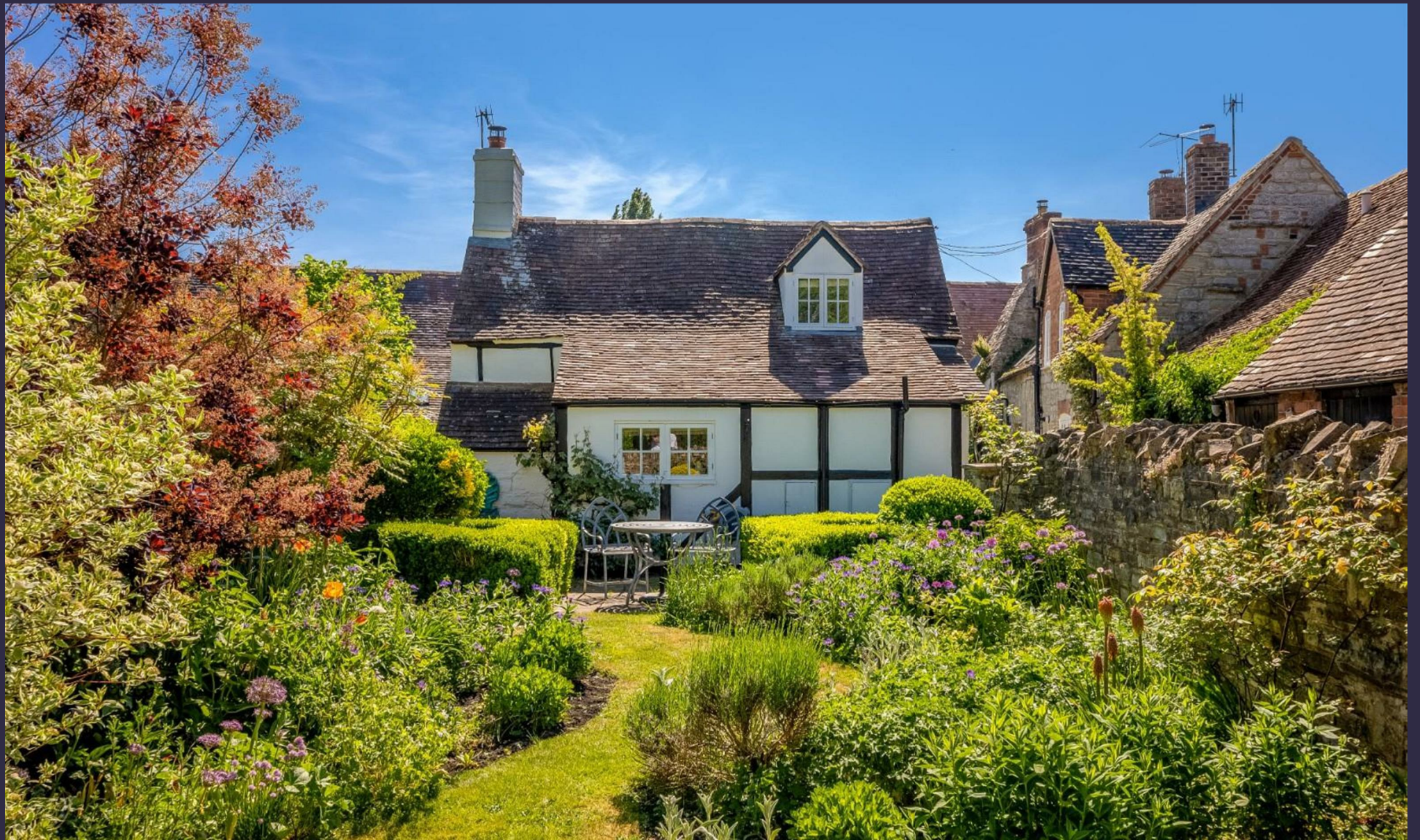
Lantern Cottage, 2 The Hamlet, Marlcliff, Alcester, B50 4NT