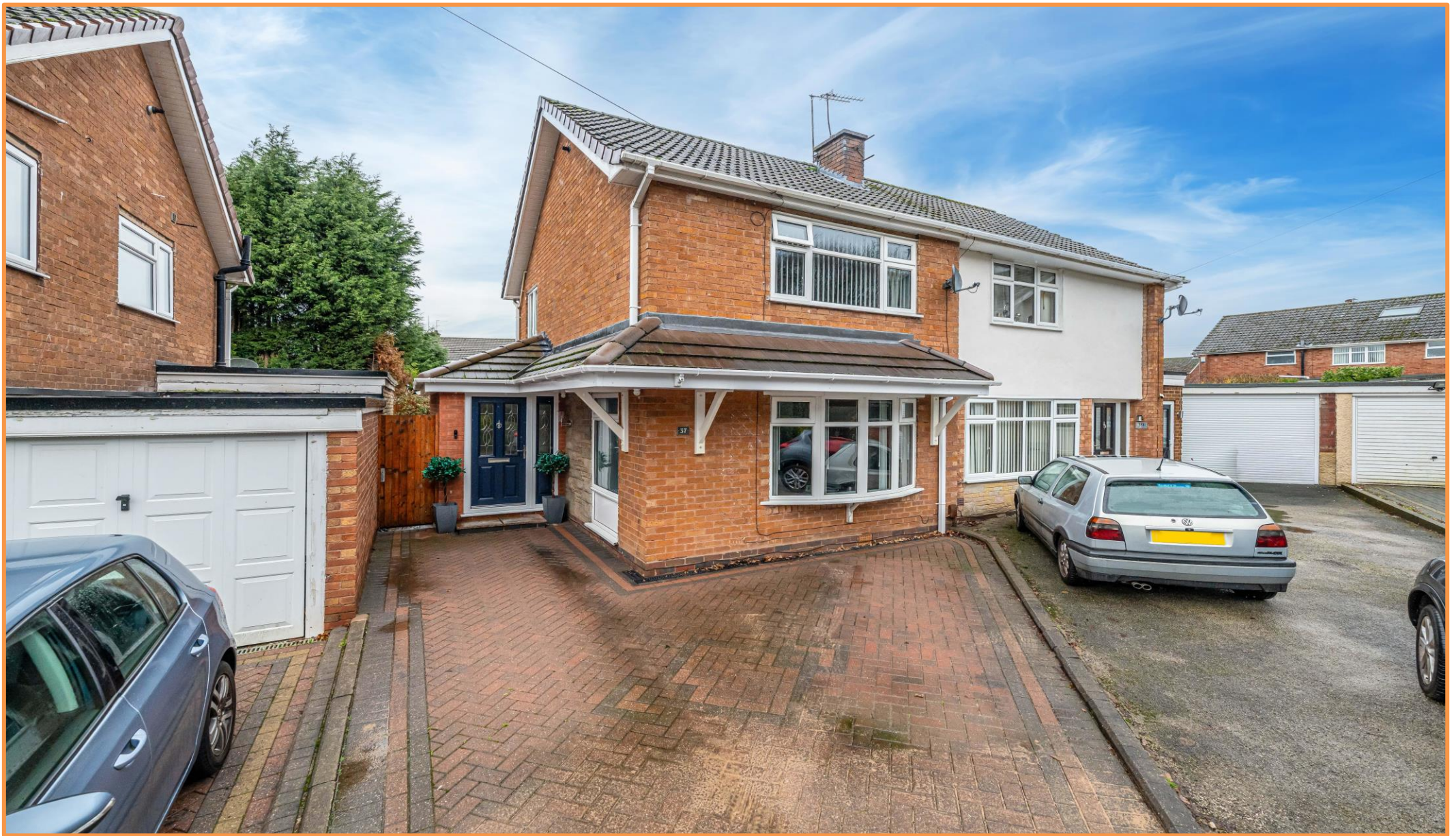
Oaken Drive, Willenhall, WV12 5NT