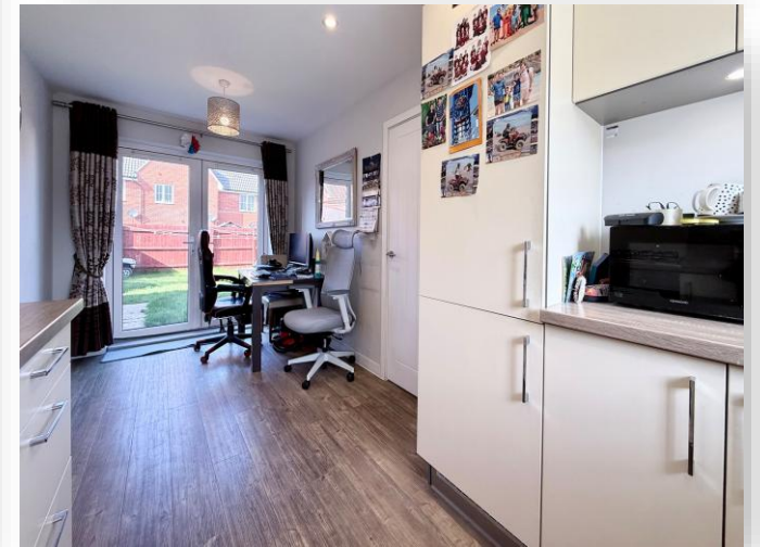
Larch Way, Red Lodge IP28 8YA