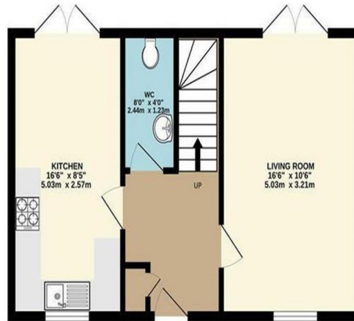
GROUND FLOOR 435 sq.ft. (40.5 sq.m.) approx.