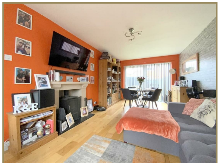
9 Rutland Drive, New Waltham, North East Lincolnshire, DN36 4PA £185,000