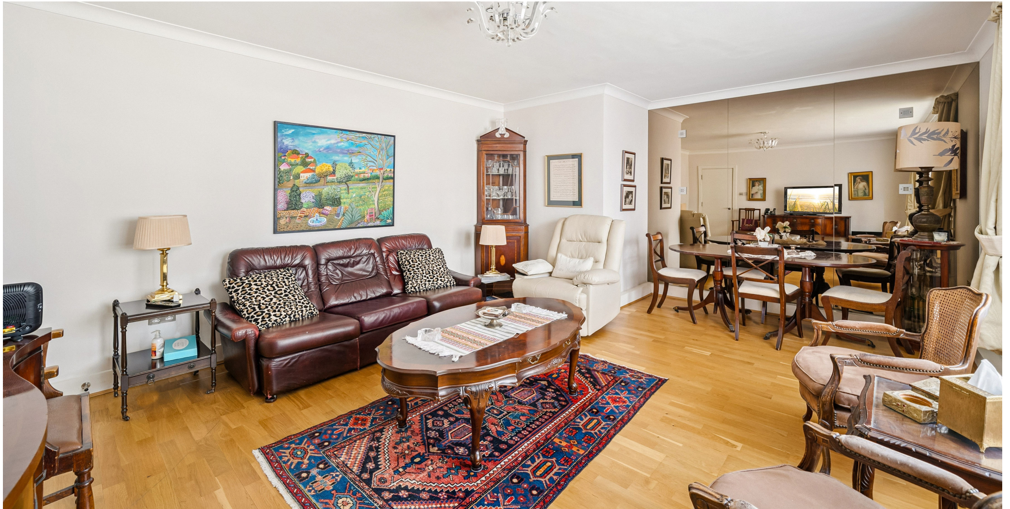
KINNERTON STREET, Belgravia SW1X