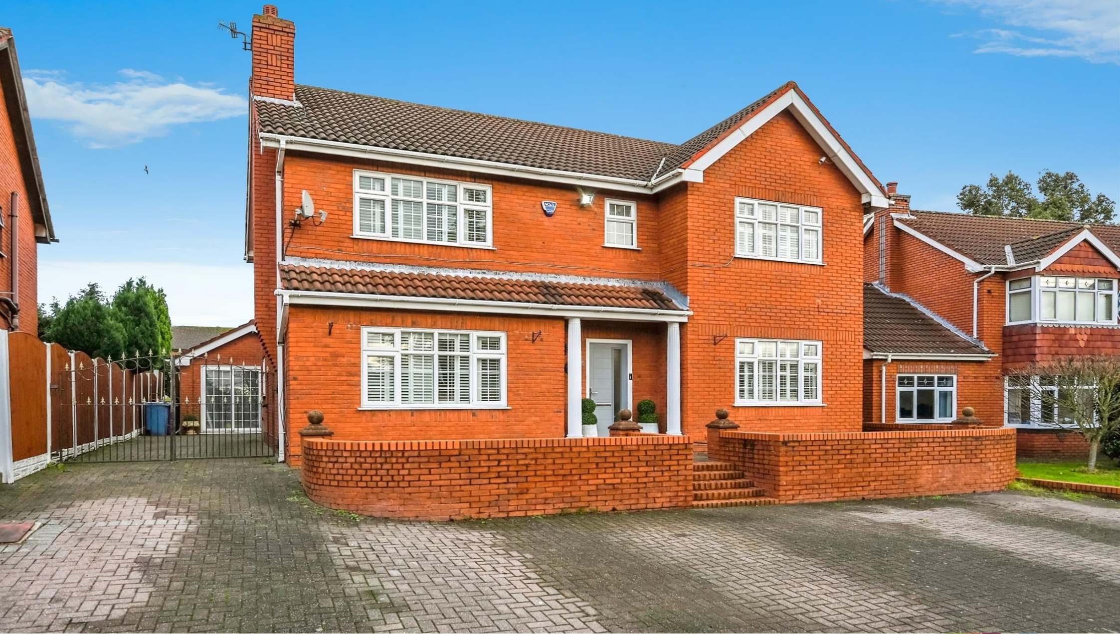
Westward View, Aigburth Liverpool L17 7EE