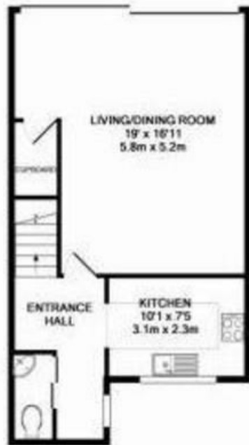
GROUND FLOOR APPROX. FLOOR AREA 477 SQ.FT. (44.3 SQ.M.)