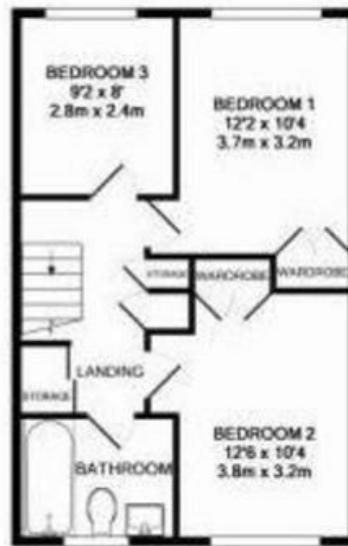
1ST FLOOR APPROX. FLOOR AREA 446 SQ.FT. (41.4 SQ.M.) TOTAL APPROX. FLOOR AREA 923 SQ.FT. (85.7 SQ.M.)