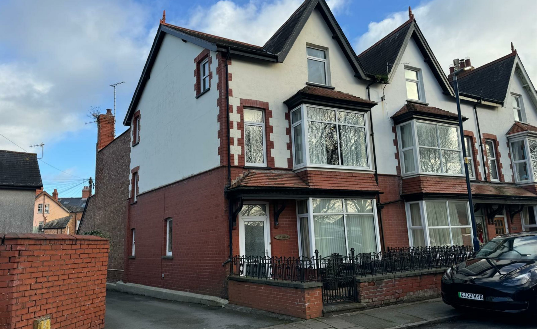
Afallon 3 Elm Tree Avenue, Aberystwyth Ceredigion SY23 1LP Guide price £325,000