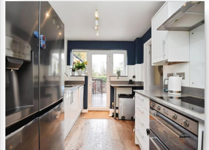
Duncan Rise, Great Yeldham, Halstead, CO9 4QE