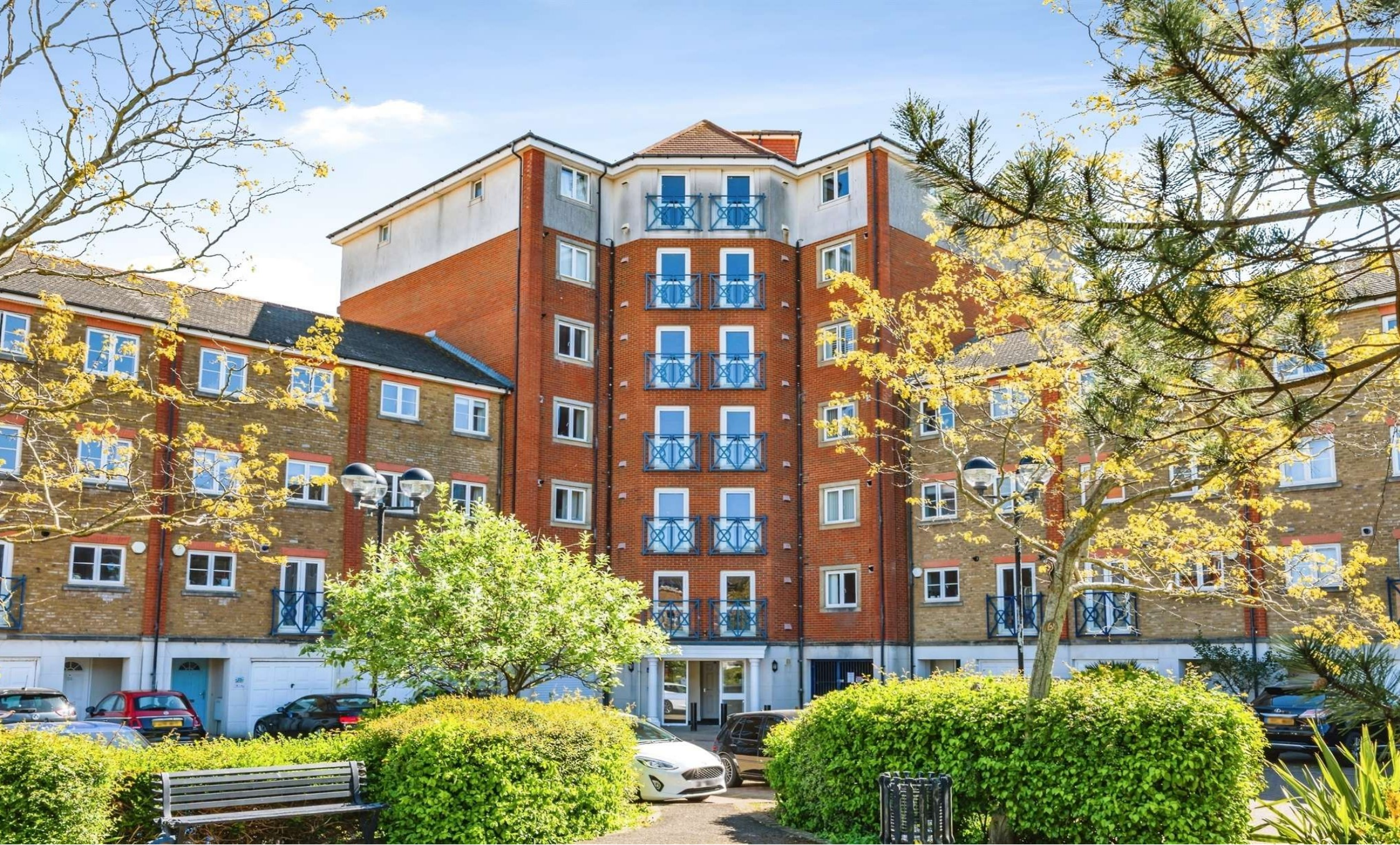
San Juan Court, EASTBOURNE BN23 5TP