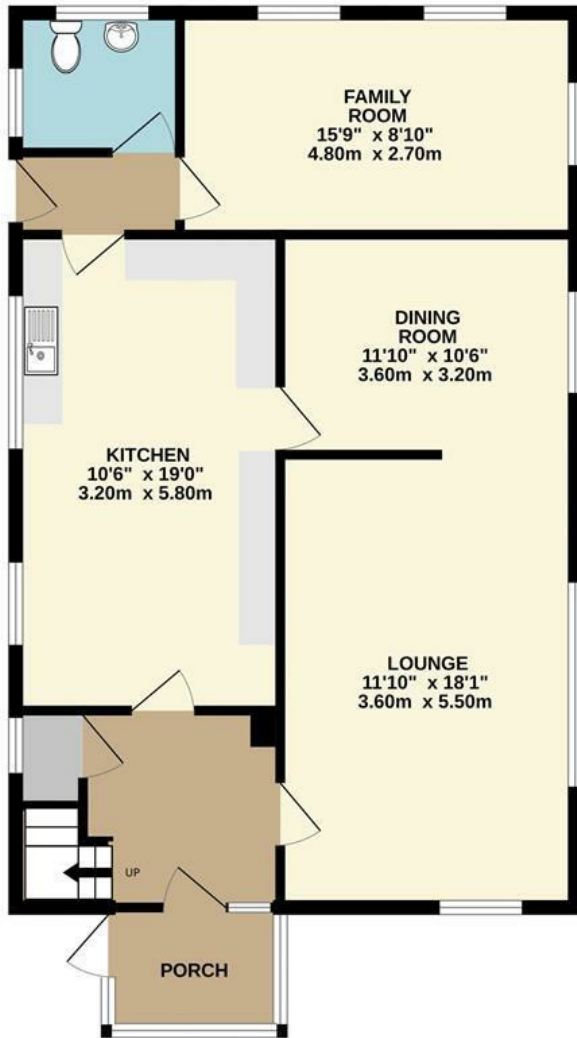
GROUND FLOOR 833 sq.ft. (77.4 sq.m.) approx.