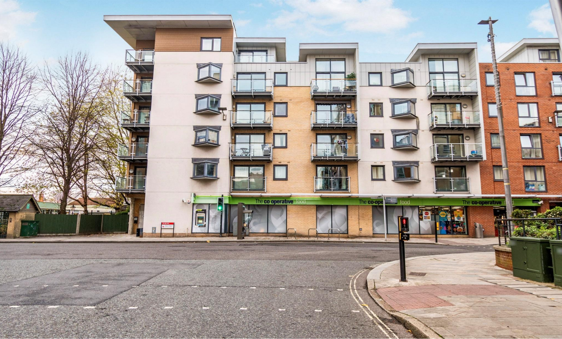
Castle Place, High Street, Southampton SO14 2EA