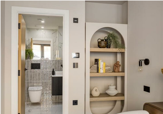
Kitchen/Dining/Reception Room 19'2" x 20'3"