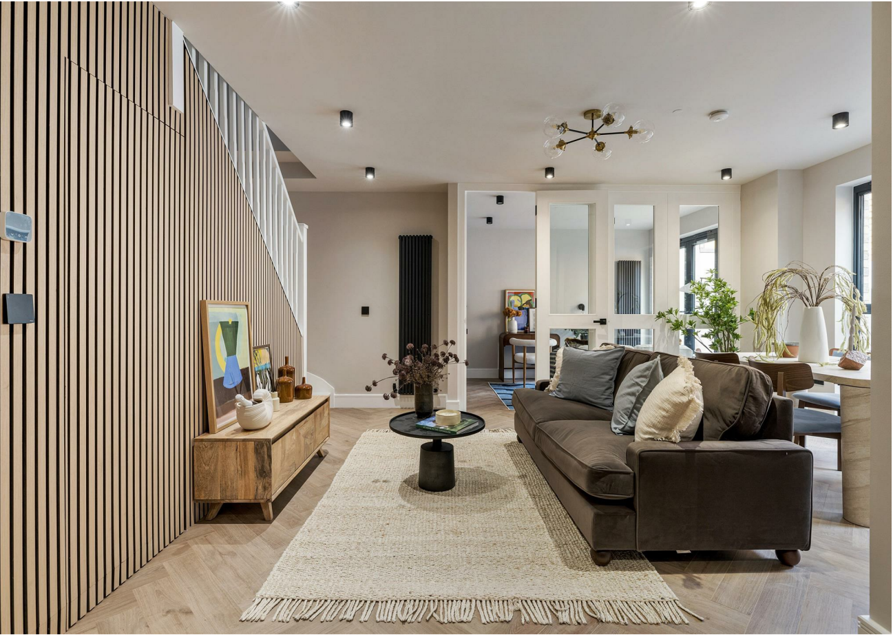
Entrance Hall 9'3" x 7'1"