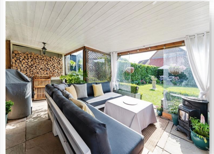
Cloughs Farm, Hythe Road, Methwold, Thetford, IP26 4PP