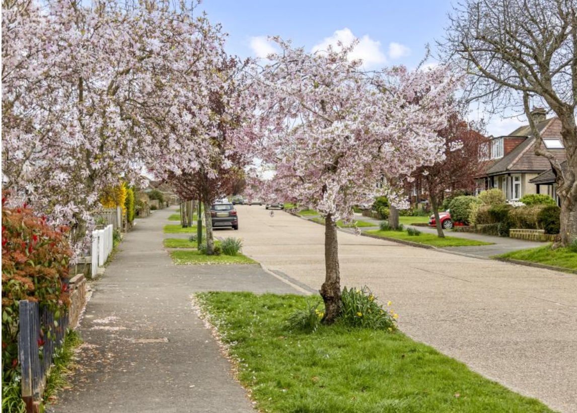
Stunning Magnolia and Blossom Trees lining Grand Avenue in Spring 2026.