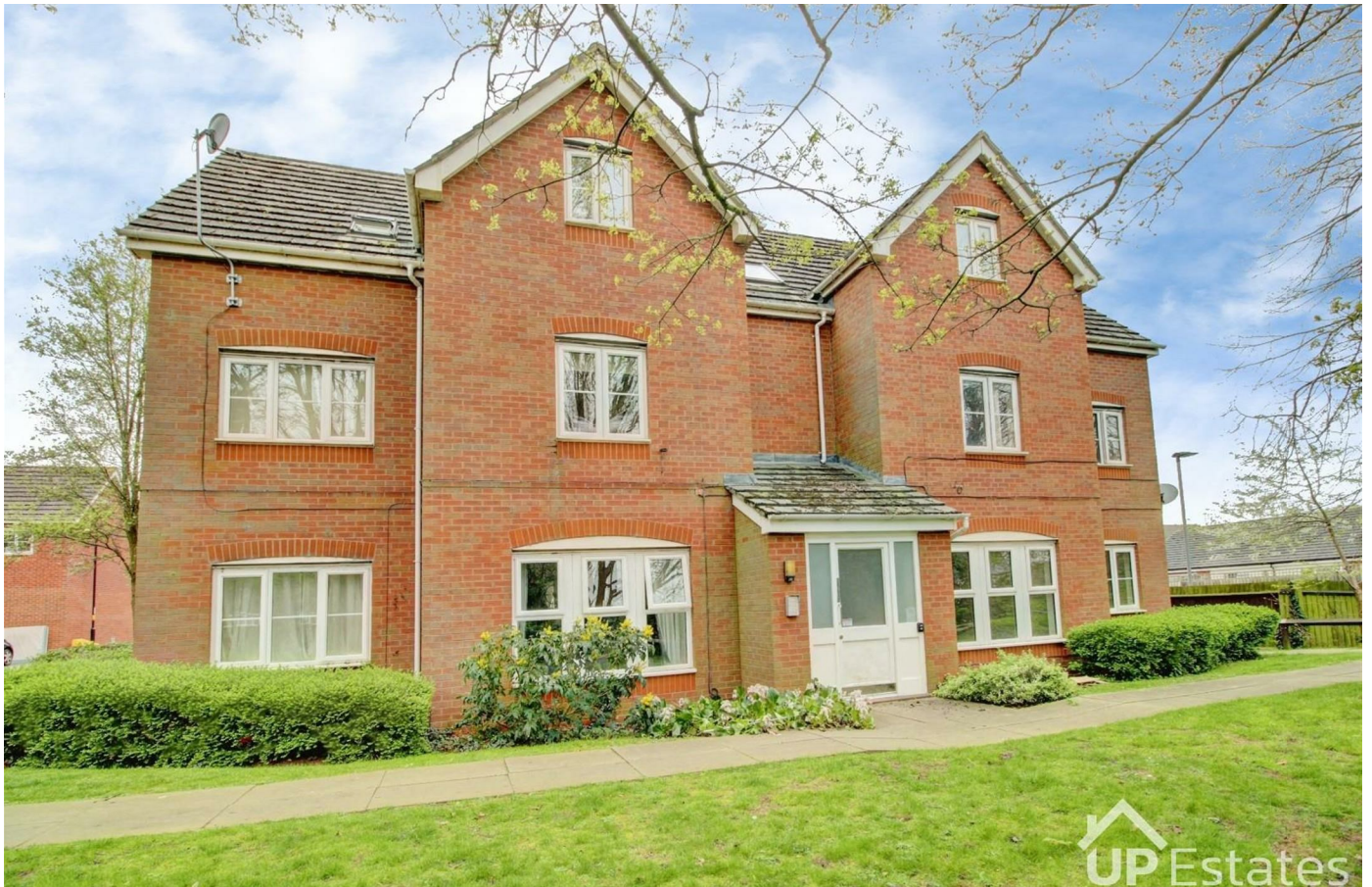
Hickory Close, Coventry