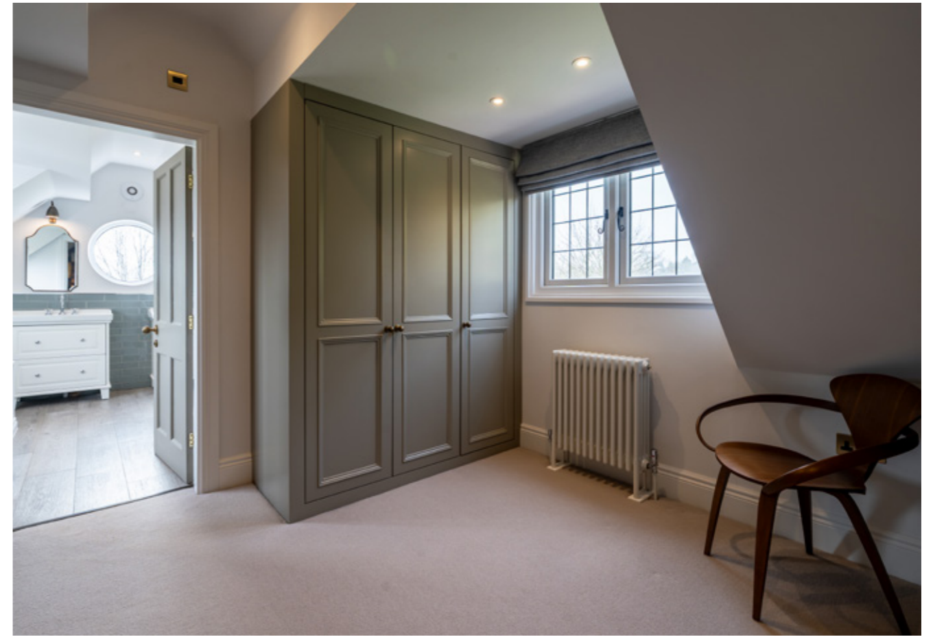
MASTER DRESSING ROOM