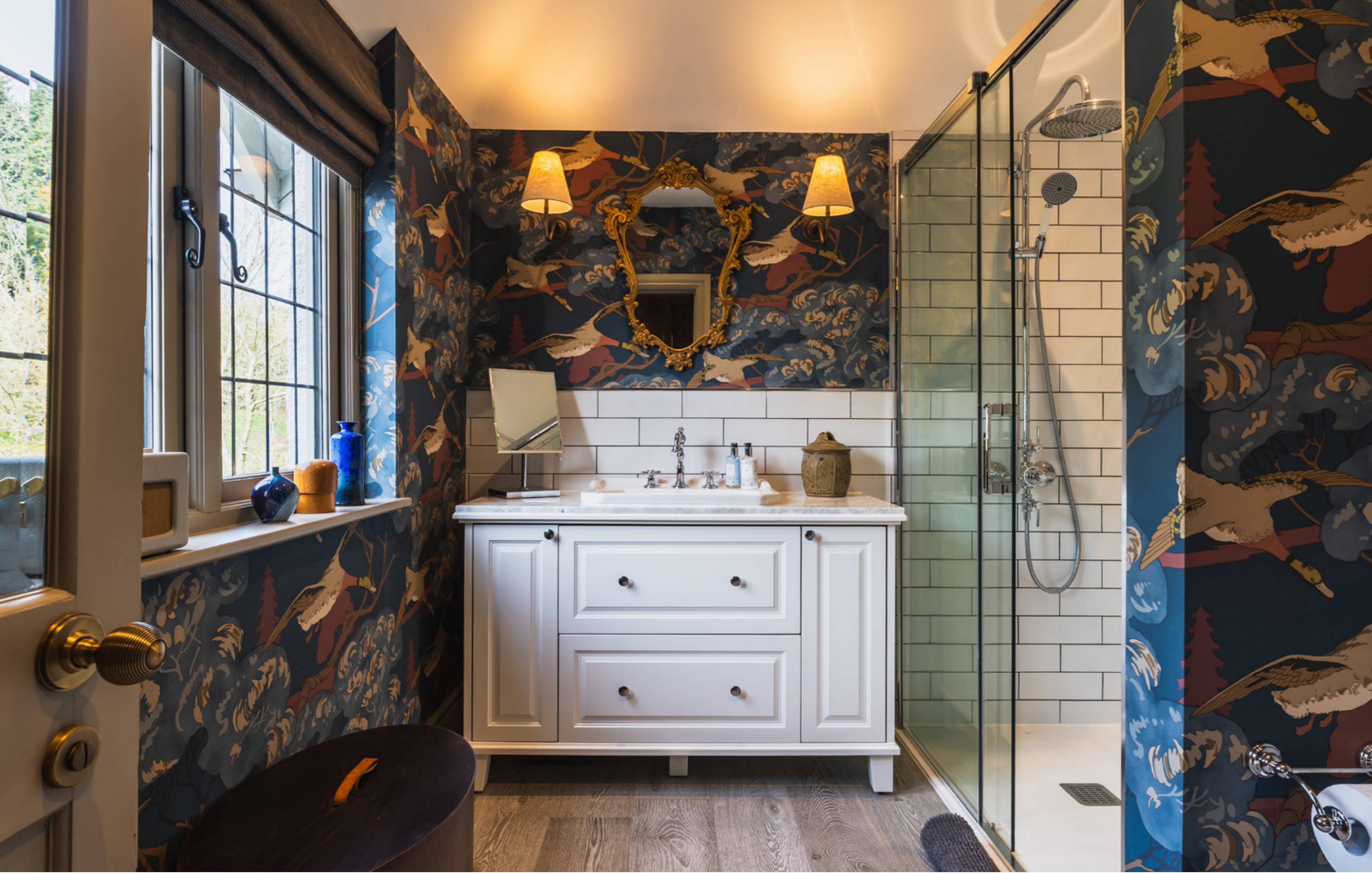
FAMILY SHOWER ROOM