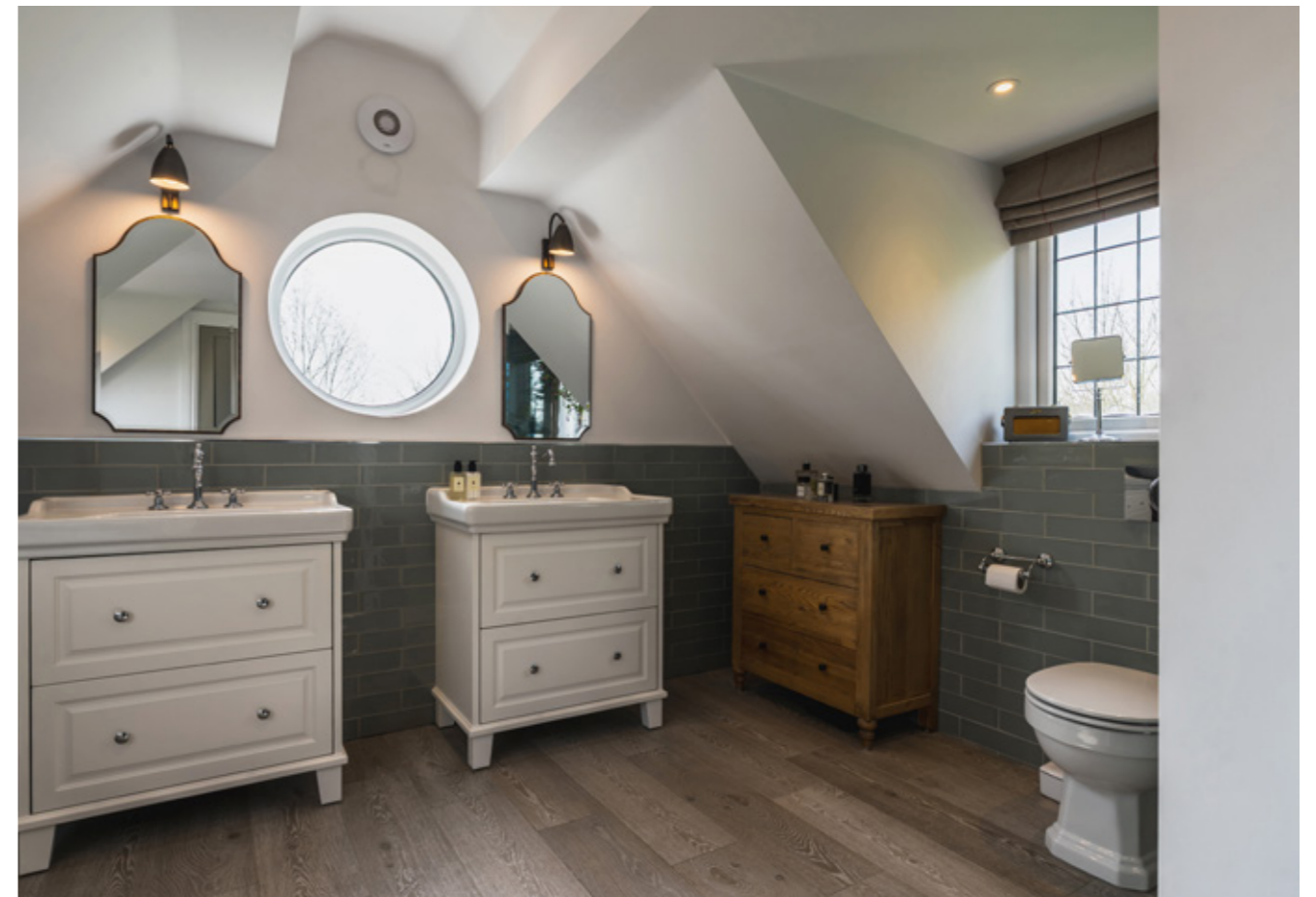
MASTER EN-SUITE BATHROOM