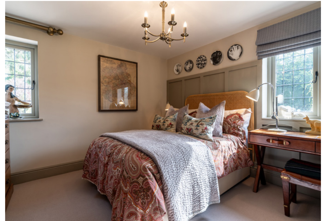
BEDROOM 4 (SELF-CONTAINED ANNEXE)