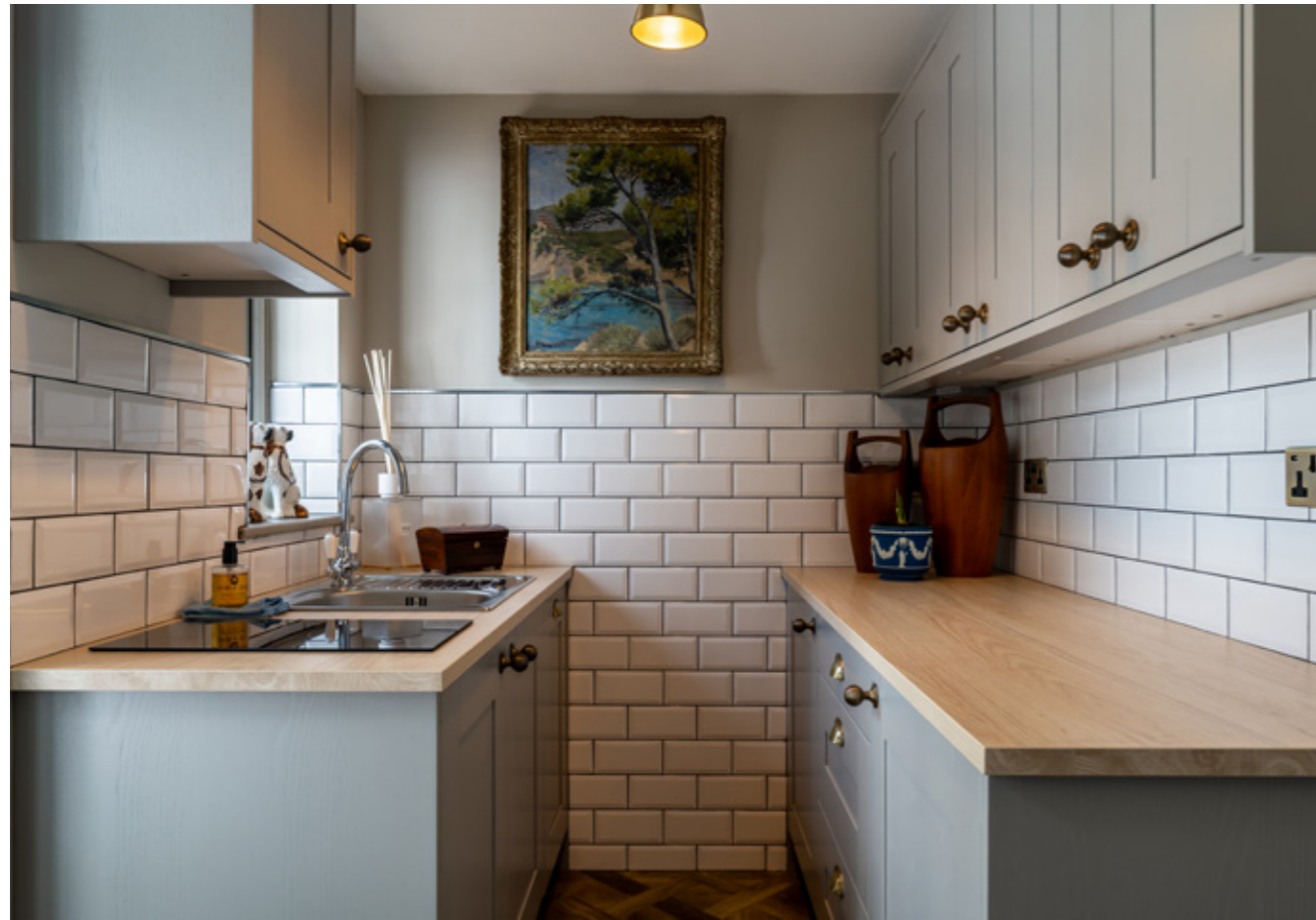
KITCHEN (SELF-CONTAINED ANNEXE)