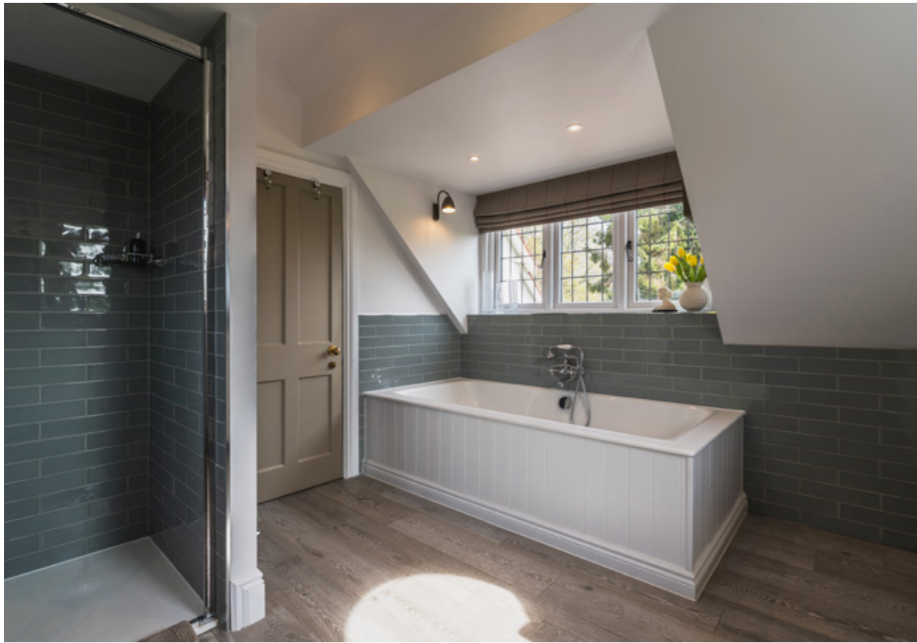
MASTER EN-SUITE BATHROOM