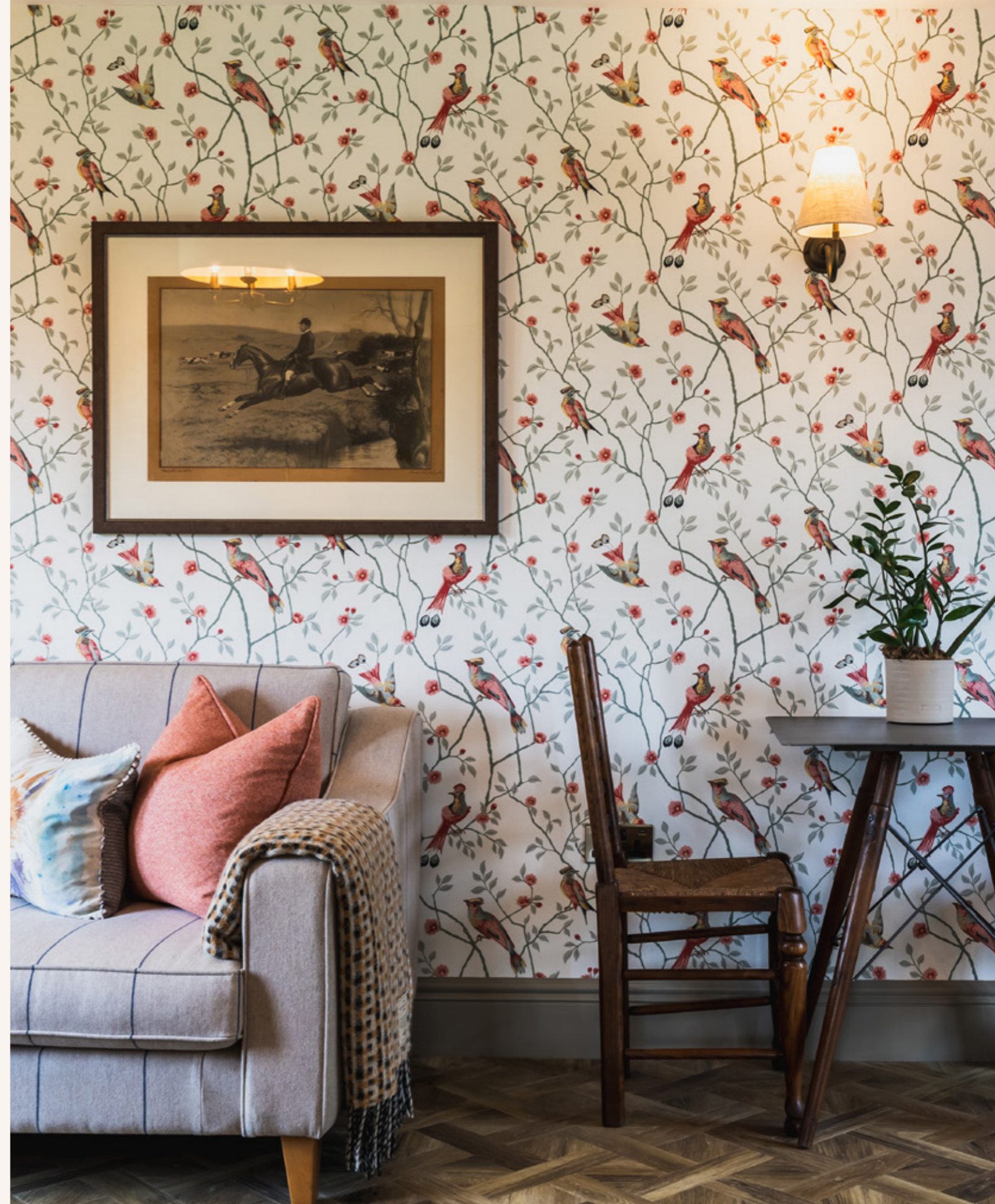
SITTING ROOM (SELF-CONTAINED ANNEXE)

From the entrance hall, a staircase with a hand rail, turned spindles and an under-stairs storage cupboard rises to the first floor.