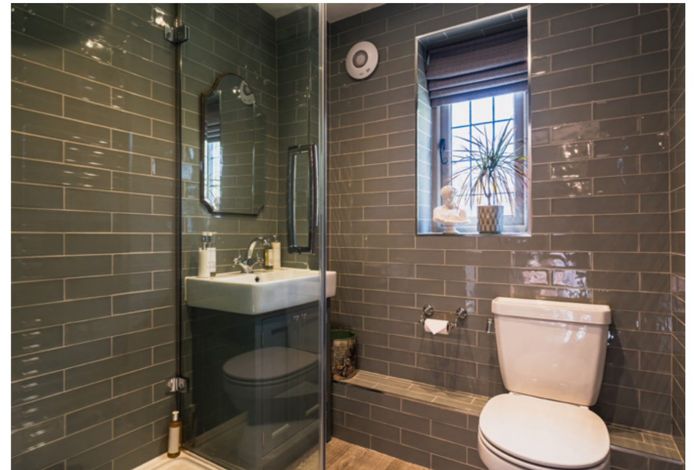
BEDROOM 4 EN-SUITE SHOWER ROOM (SELF-CONTAINED ANNEXE)