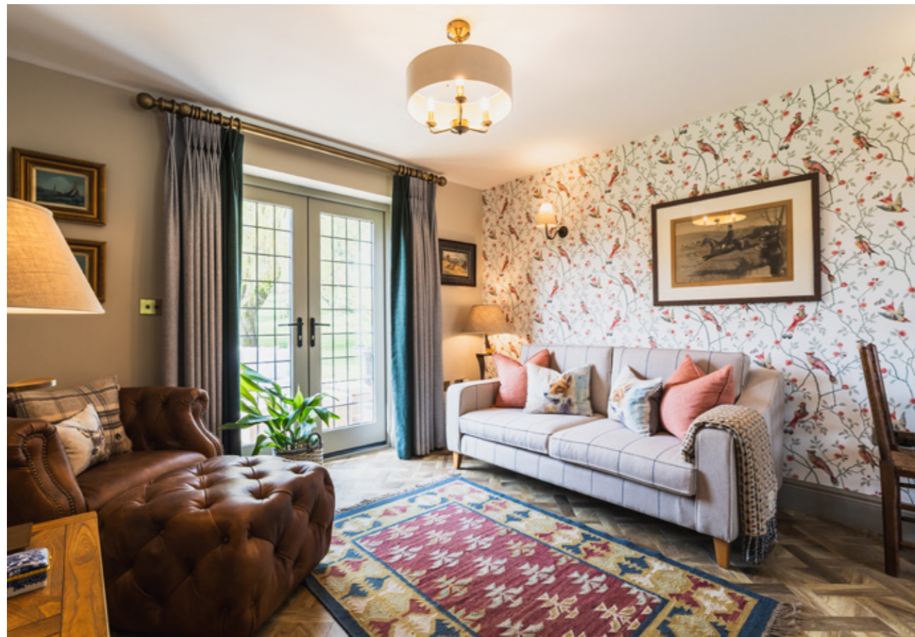
SITTING ROOM (SELF-CONTAINED ANNEXE)