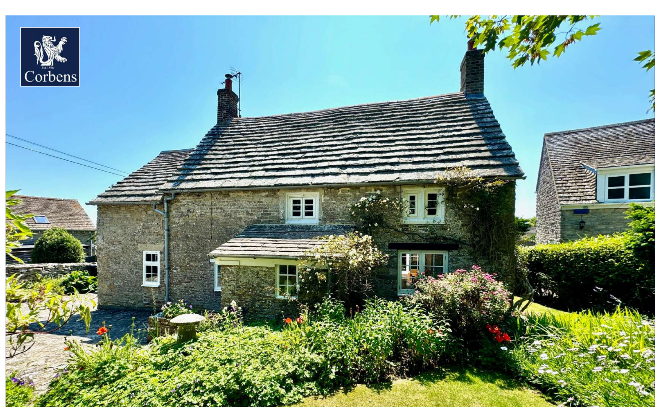
HONEYSUCKLE COTTAGE, WORTH MATRAVERS £795,000 Freehold