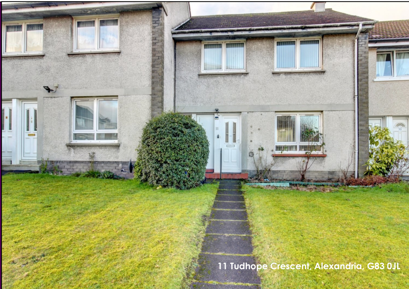
11 Tudhope Crescent, Alexandria, G83 0JL

David Muir Estate Agents are delighted to present this spacious three-bedroom mid-terrace villa, set within the ever-popular Tullichewan Estate and ideally positioned for local schooling, convenience shopping and excellent public transport links. The property offers generous accommodation throughout and represents an excellent opportunity for buyers looking to place their own stamp on a home, as internal modernisation will be required.