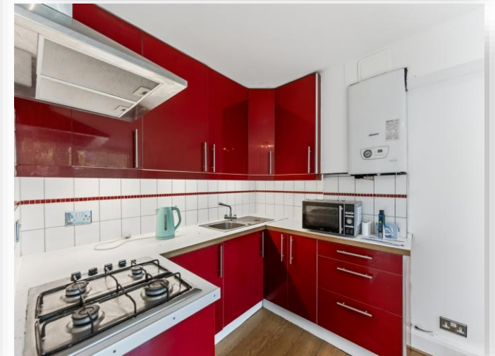
Maskell Road, London SW17 0LE