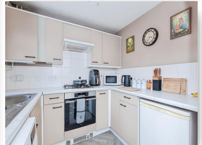
Hilcot Green, Braunstone Leicester LE3 3SY