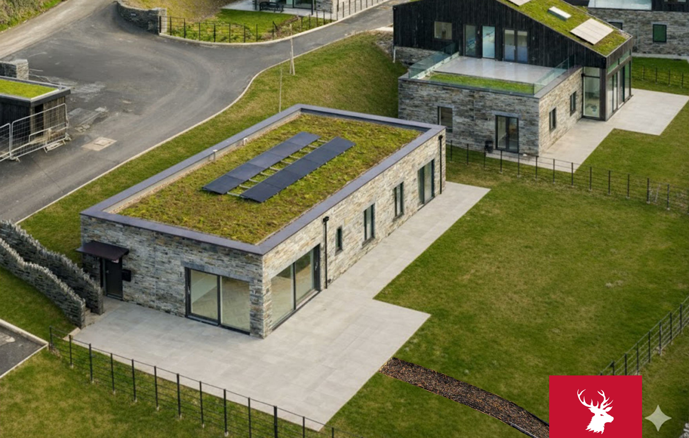
House 1, Lee Bay Gardens