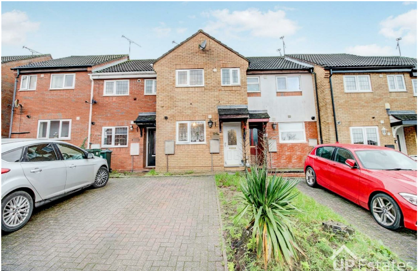
Ladymead Drive, Coventry