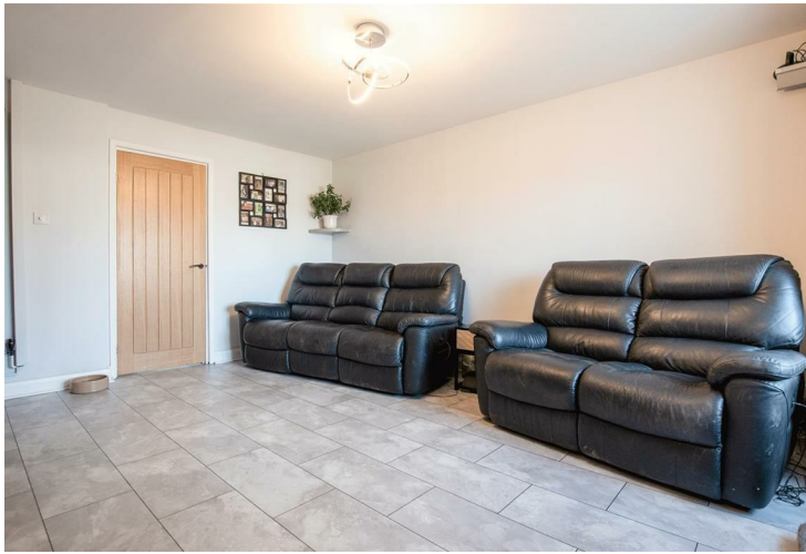
Porch Entrance Hall