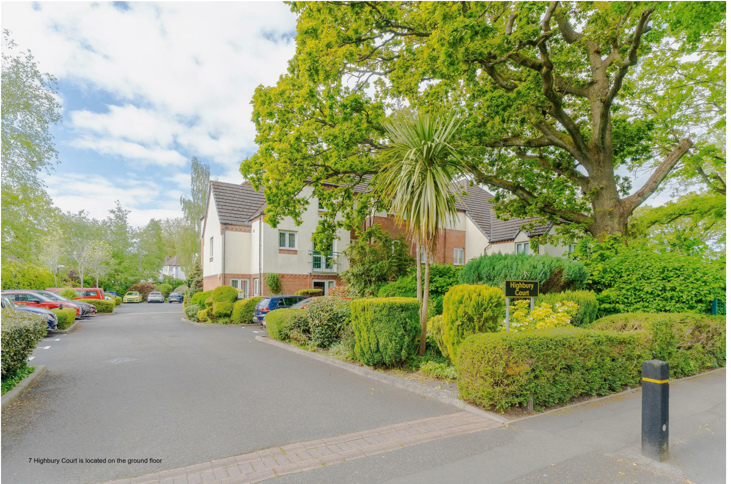
7 Highbury Court is located on the ground floor

7 Highbury Court, Howard Road East, Kings Heath, Birmingham, B13 0RQ