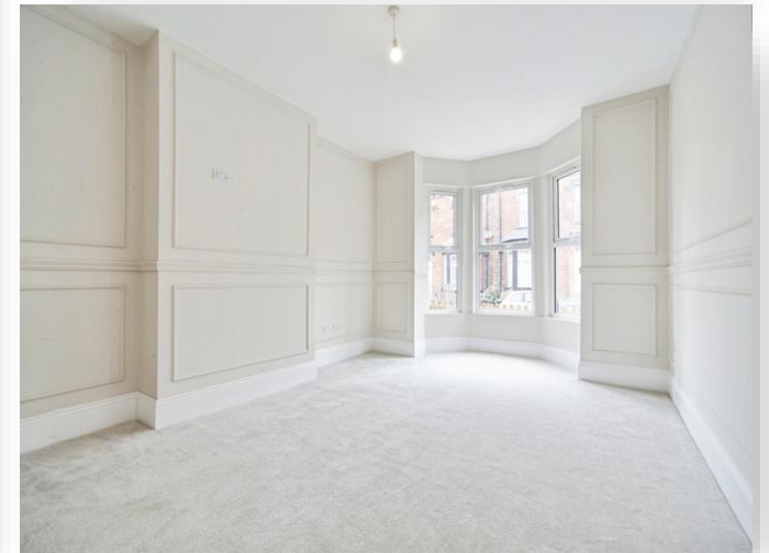
Sholebroke Mount, Leeds LS7 3HG