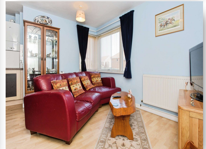
Skeaping Close, Newmarket, CB8 0GQ