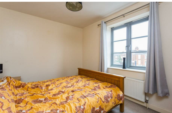
Lady Smith Court, Selby, YO8 4ES