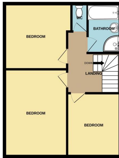
1ST FLOOR 527 sq.ft. (49.0 sq.m.) approx.