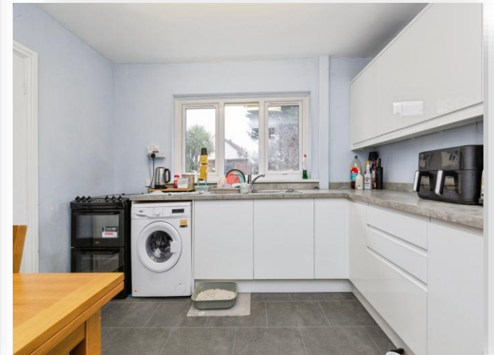
Wollaton Road, Billingham TS23 3AU