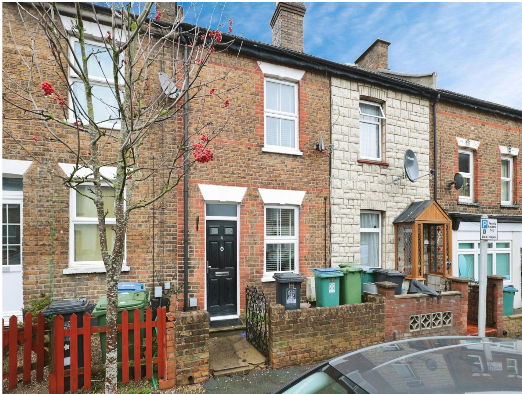
Cross Street, Watford, WD17 2QD