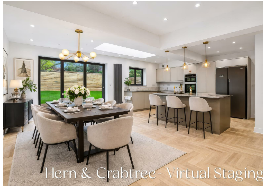
Hern & Crabtree - Virtual Staging

Offered with no onward chain, this is a well resolved home in a sought after setting.