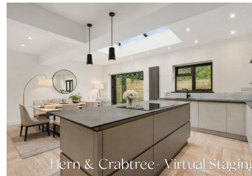
Hern & Crabtree - Virtual Staging