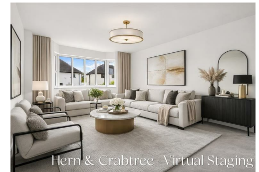
Hern & Crabtree - Virtual Staging