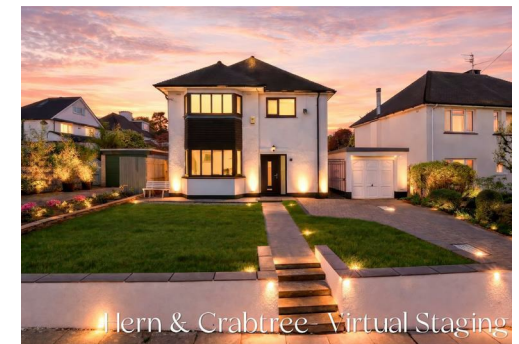
Hern & Crabtree - Virtual Staging