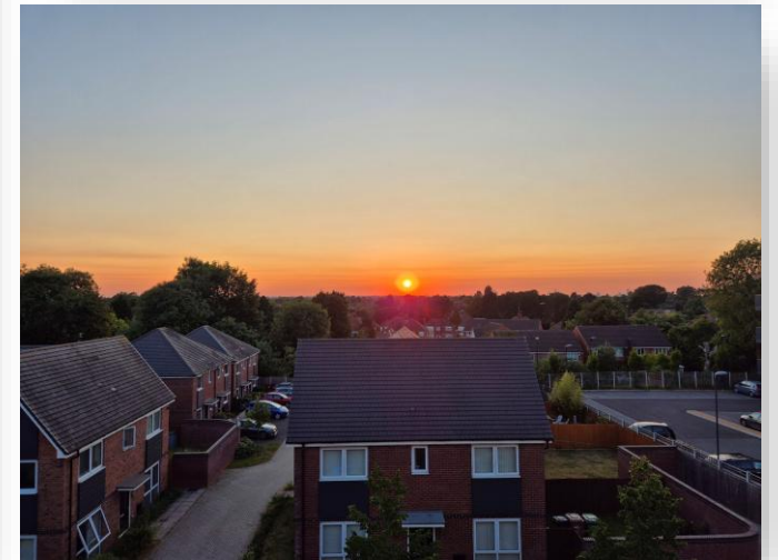
Victoria Crescent, Shirley SOLIHULL B90 2FG