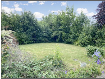
Further Rear Aspect