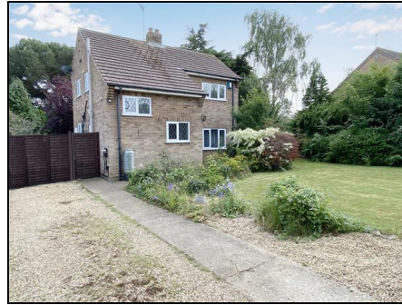
Further Front Aspect