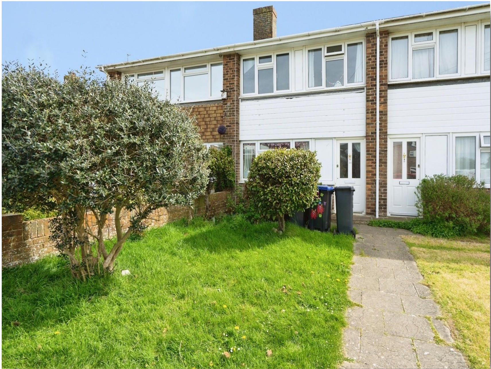
Shadwells Road, Lancing BN15 9EW