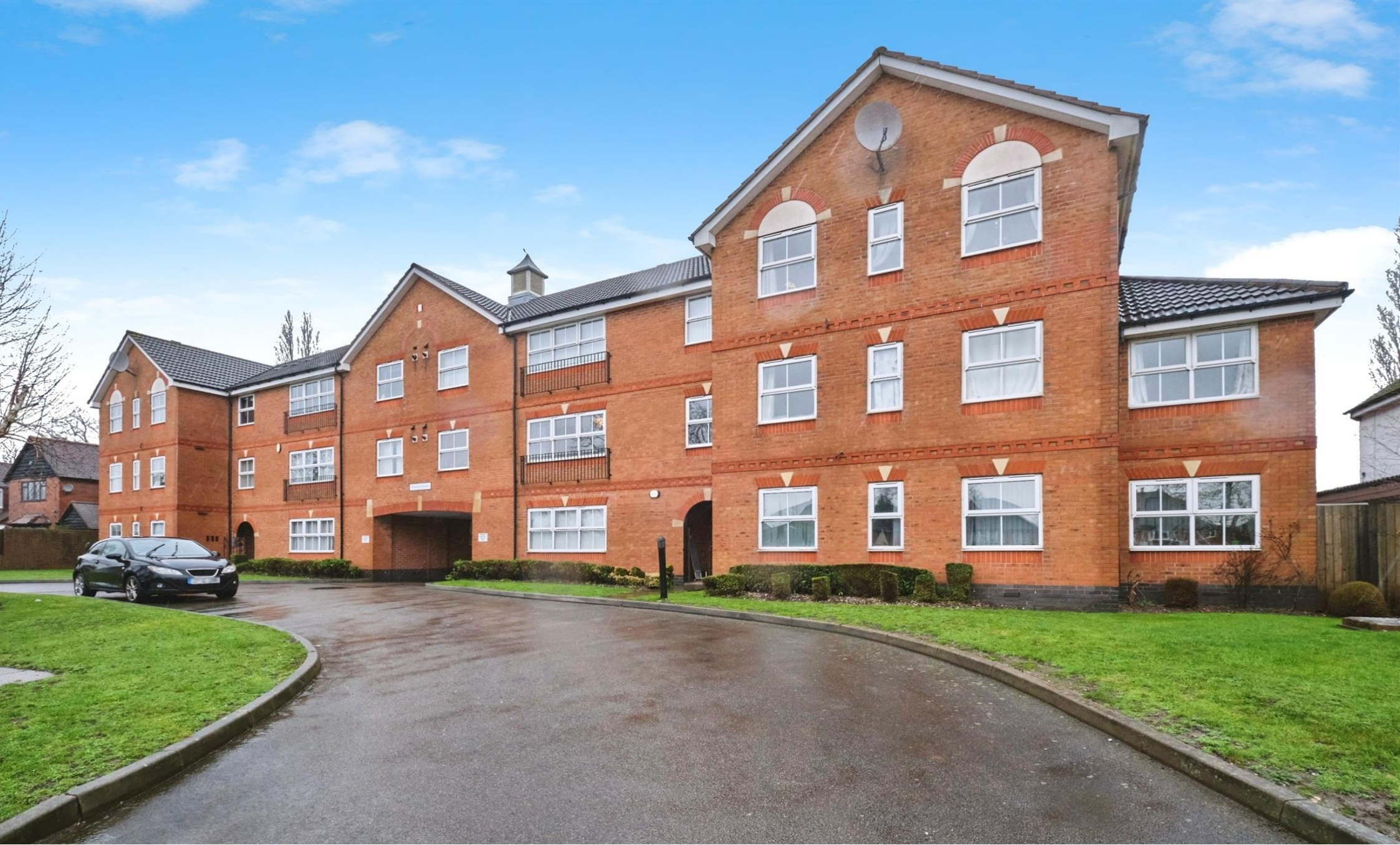
Hawley Court Newton Road, Great Barr BIRMINGHAM B43 6AF