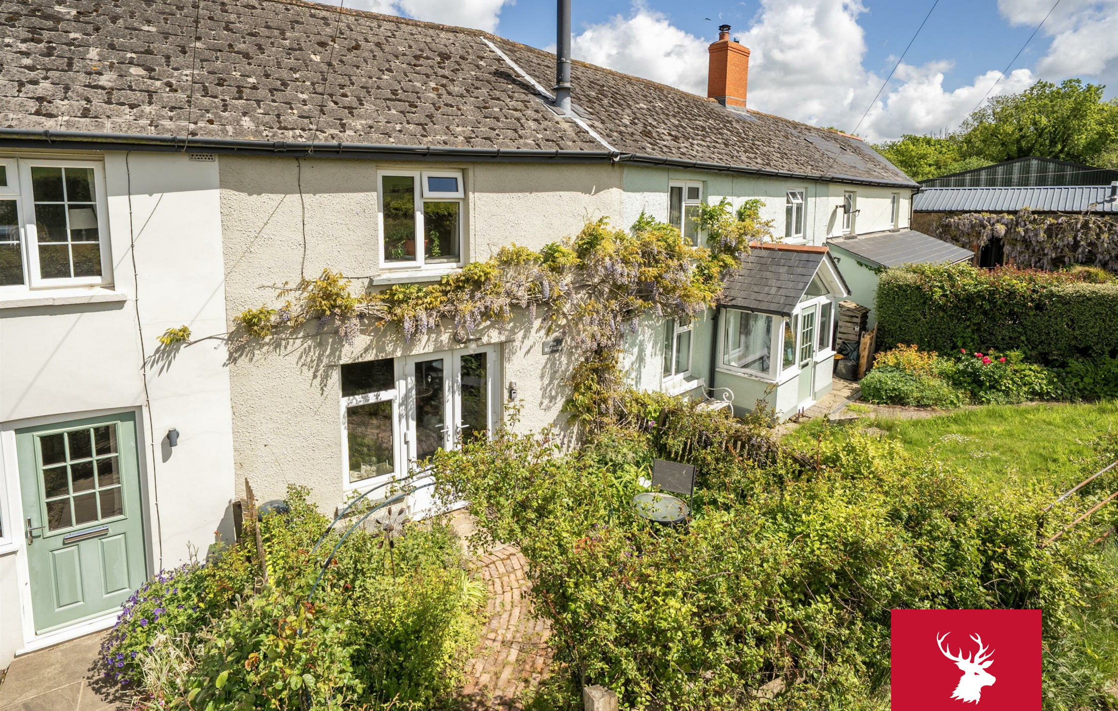
The Bolt Hole