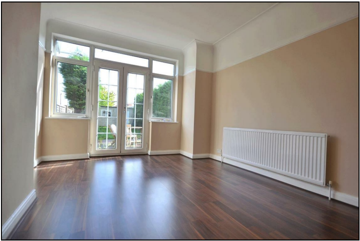
Reception Reception Bedroom Bedroom Bedroom Kitchen