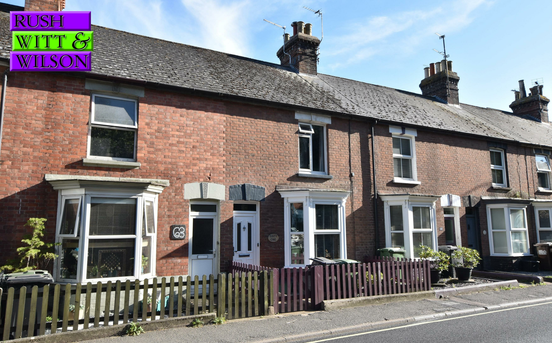
61 South Undercliff, Rye, East Sussex TN31 7HN Guide Price £295,000