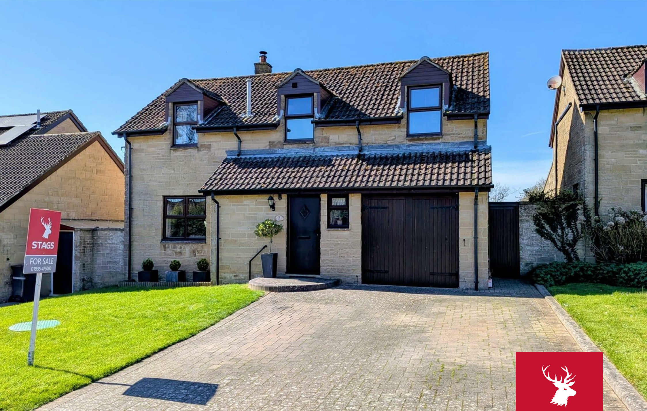
3, Weston Close