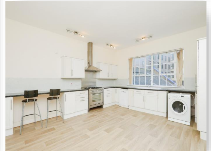
Flat C Muspole Street, Norwich, NR3 1DJ