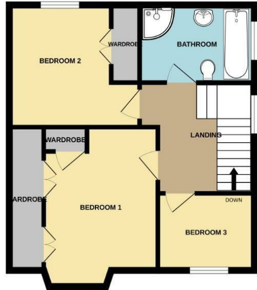
THREE BEDROOM SEMI DETACHED

Whilst every attempt has been made to ensure the accuracy of the floorplan contained here, measurements of doors, windows, rooms and any other items are approximate and no responsibility is taken for any error, omission or mis-statement. This plan is for illustrative purposes only and should be used as such by any prospective purchaser. The services, systems and appliances shown have not been tested and no guarantee as to their operability or efficiency can be given. Made with Metropix ©2026