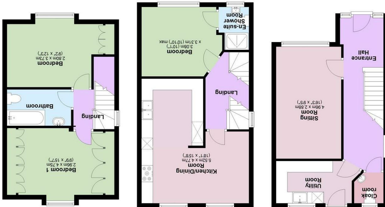
Second Floor Approx. 36.7 sq. metres (394.8 sq. feet)

Total area: approx. 113.3 sq. metres (1220.1 sq. feet)