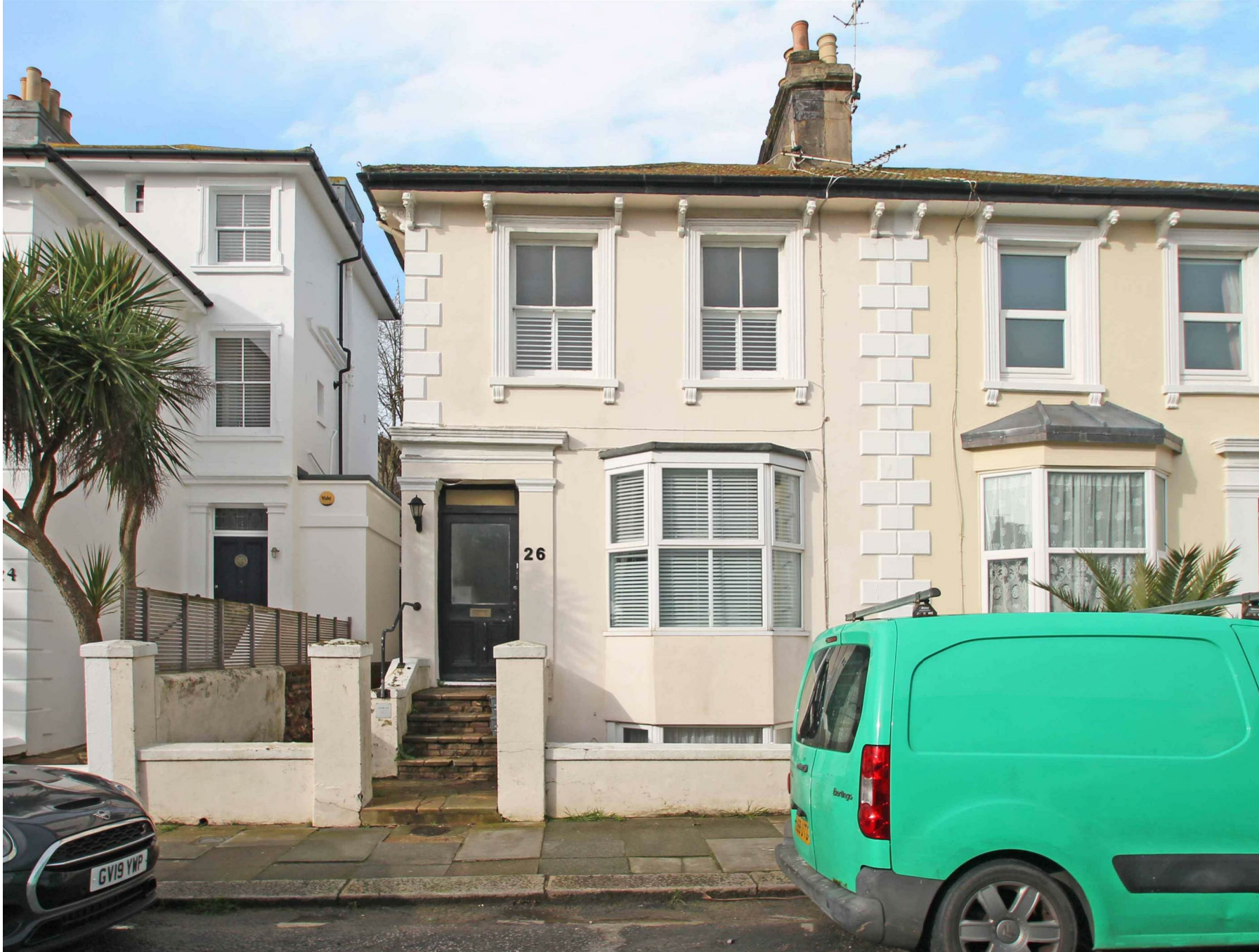
Hova Villas, Hove, BN3 3DF £250,000