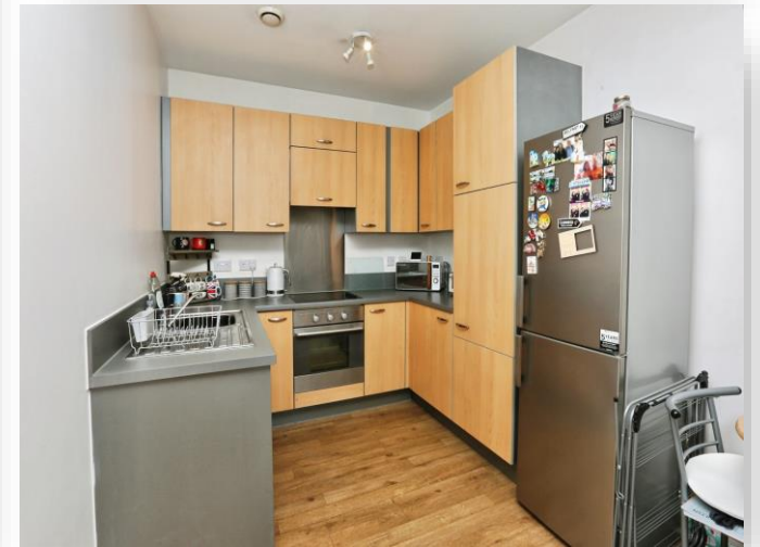
Cooperage Green, Gosport PO12 1FN