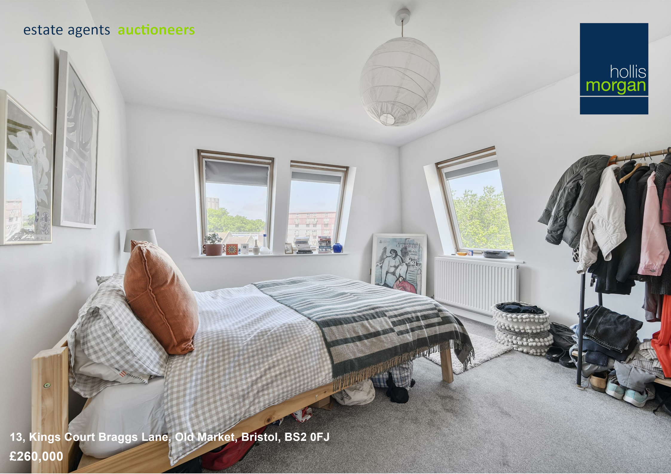
13, Kings Court Braggs Lane, Old Market, Bristol, BS2 0FJ £260,000