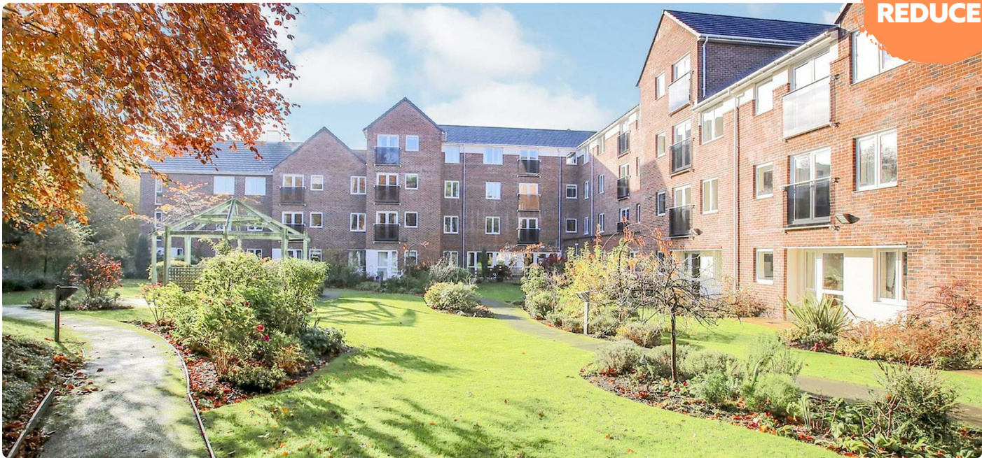
27 Dutton Court, Station Approach, Cheadle Hulme Approximate Gross Internal Area 642 Sq Ft/60 Sq M