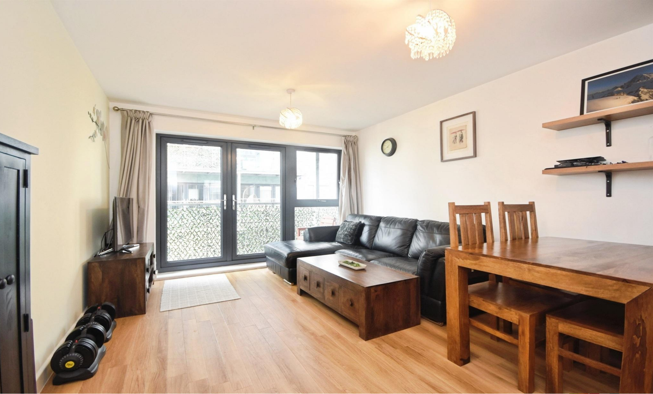
Brooking House, Rollason Way, Brentwood, CM14 4ET